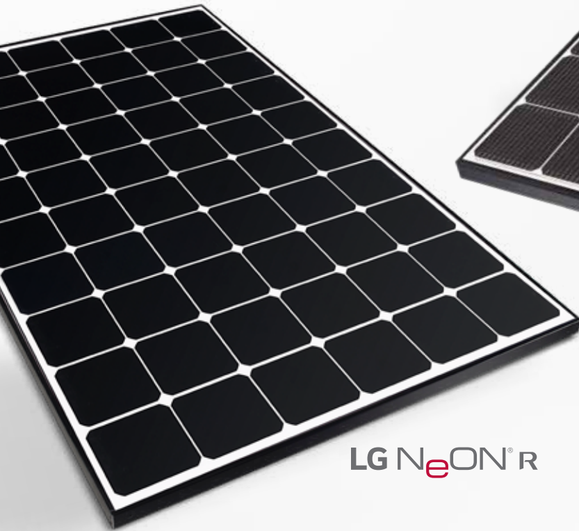
LG NeON ® R