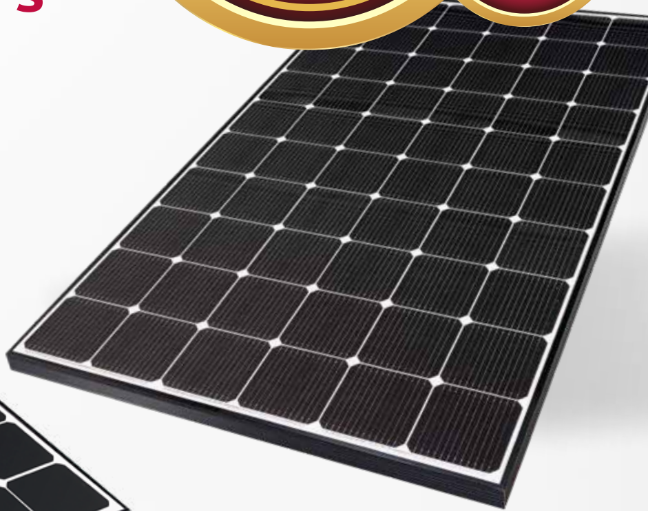
LG NeON ® 2